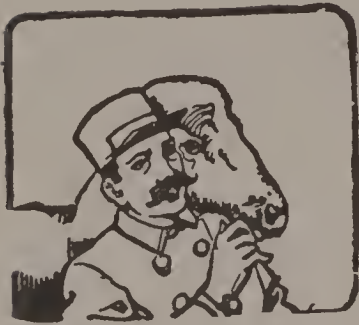
Put Her Head on the Keeper's Shoulder.